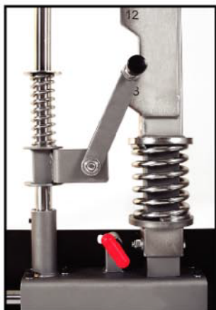
Safety Spotter, Dampening Spring and Locking Pin